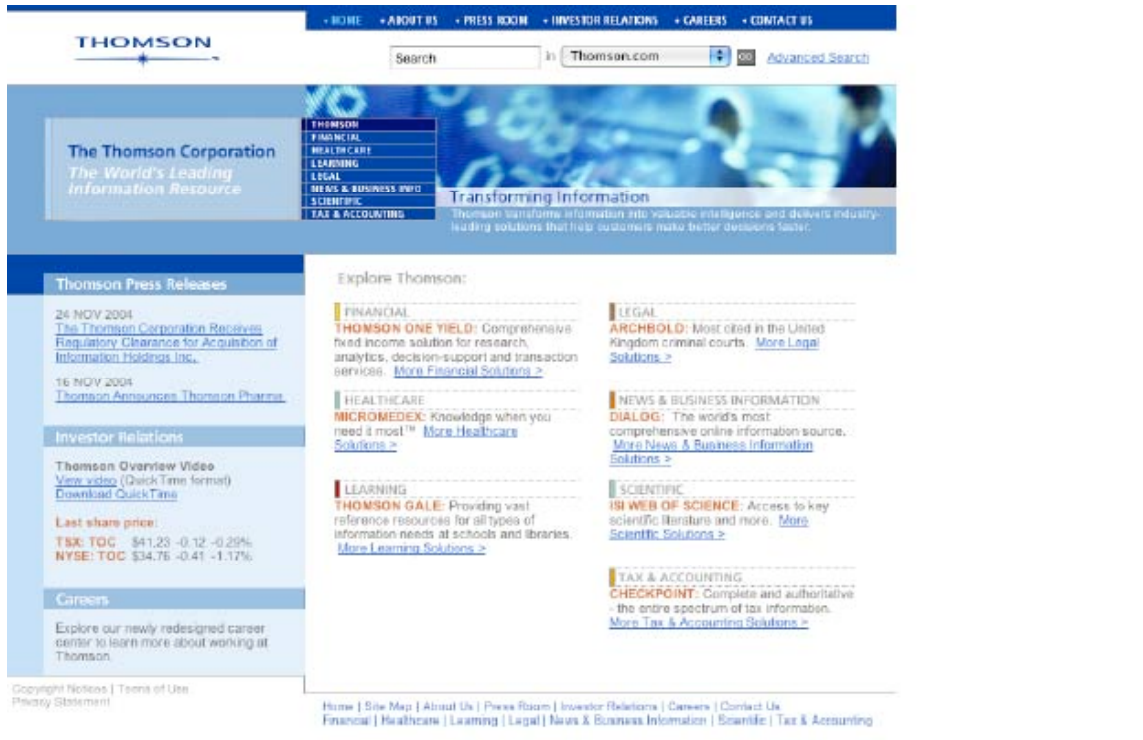
Figure 1: Home Page (1024x768 resolution, 12" monitor, window maximized)